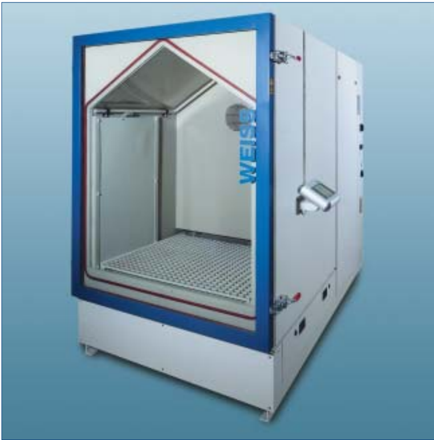
Corrosion climate Alternating Test Chambers Type SC 1000/+20 IM

A complete line of systems is available offering test space volumes ranging from approx. 34l to 1,540 litres, a working range from -75 \dots +180^\circ\text{C} and relative humidity values ranging from 10...98% r.h.